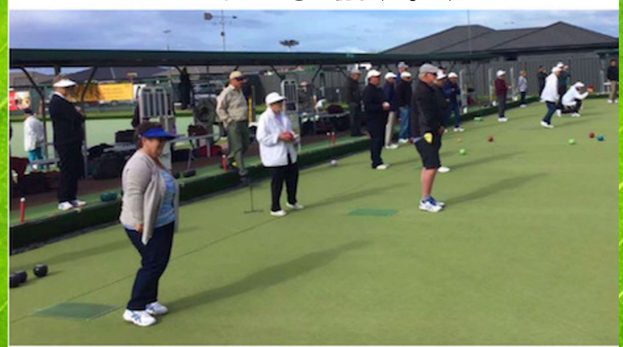
FRIDAYS FROM 12PM