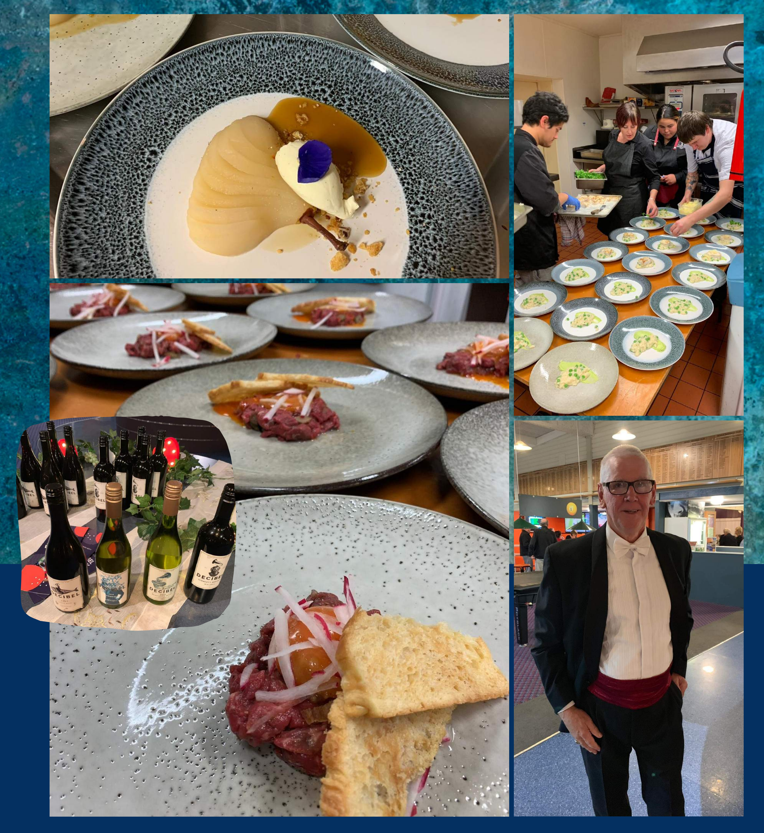
FOOD & WINE PAIRING WITH DECIBEL