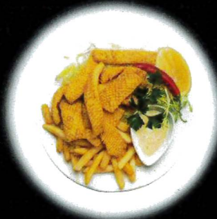
Lemon Pepper Calamari, served with fries $22