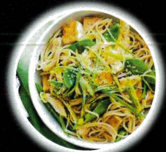
Chicken & Soba Noodle Salad, herbs, vegetables soy sauce dressing $20