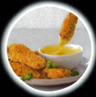
Crumbed Chicken Tenders served with BBQ sauce & fries $20