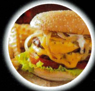
Classic Fish or Cheese Burger & fries $22