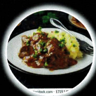
Lamb's Fry & Bacon served in a creamy jus with mashed potato $23