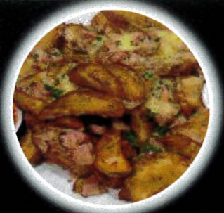
Loaded Wedges with sweet chilli & sour cream $19