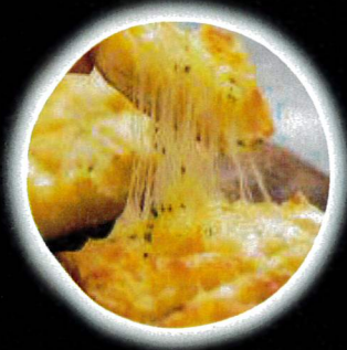
Garlic Bread with Cheese $12