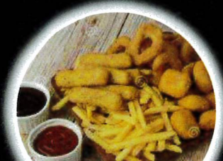
Fried Platter, samosas, spring rolls, fish bites & dumplings with fries & dips $32