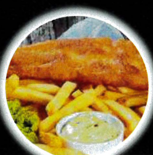
Fish n Chips battered or crumbed $23