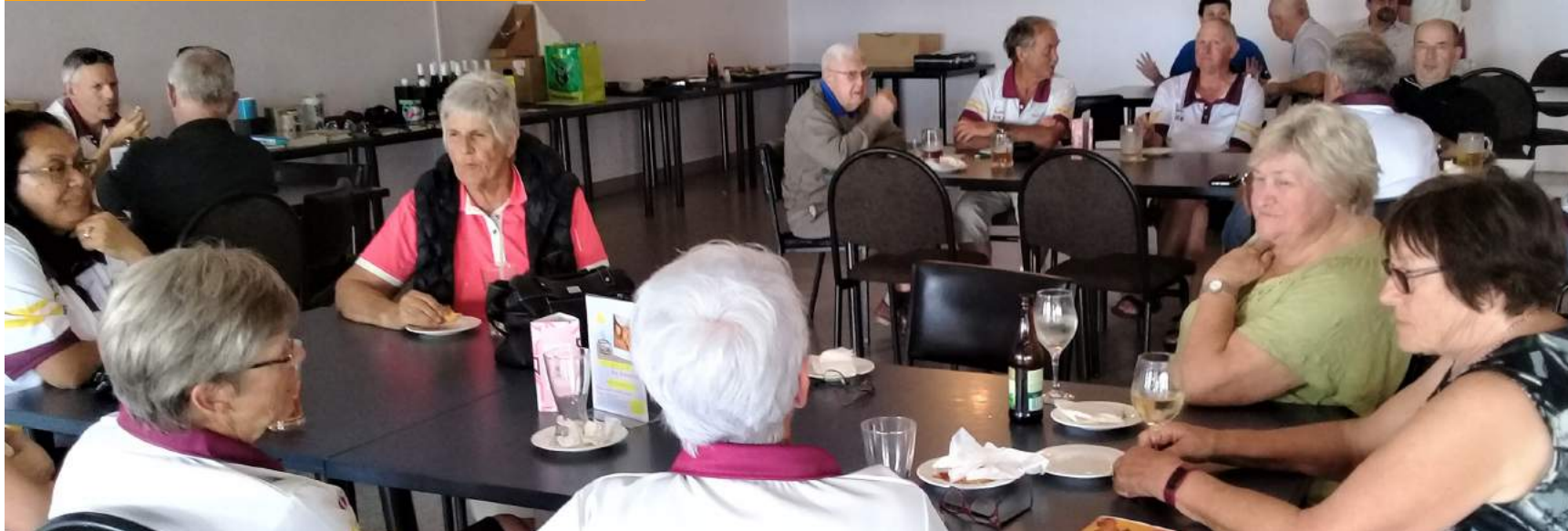
Lunch over, now for the prizes!