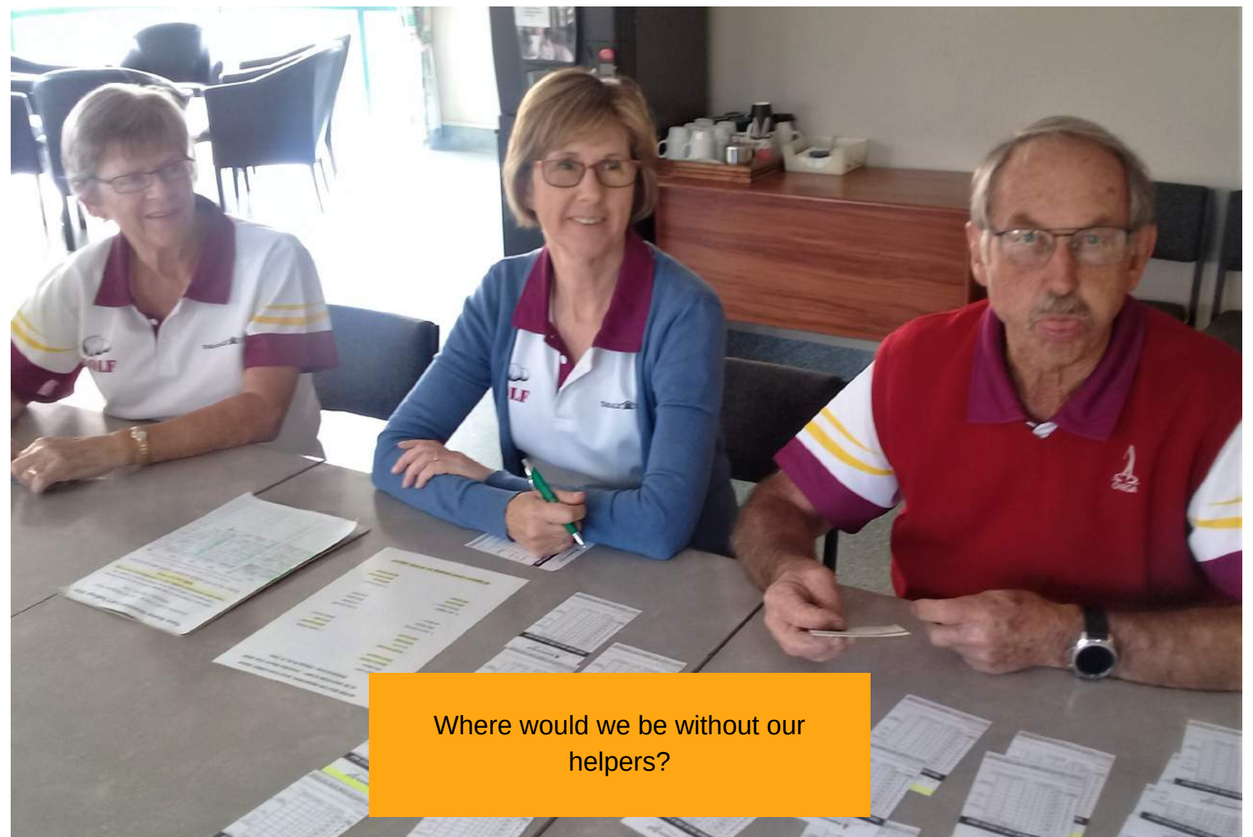
Where would we be without our helpers?